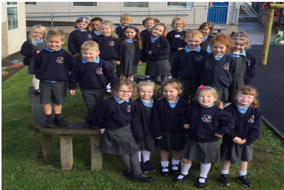
Hello to our 20 new P1 pupils!

We use Google Classroom to communicate with P1-7 parents. If you are having any difficulty accessing Google Classroom please contact your child's class teacher. If you don't use this, you will miss out on important communication.