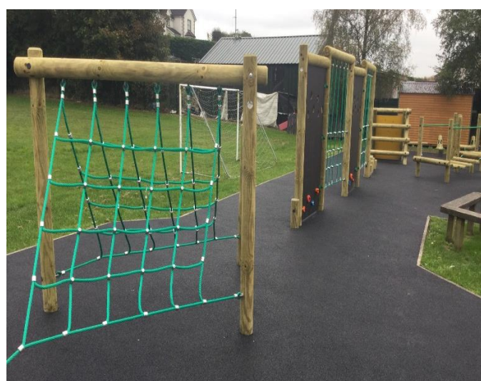
Our New Soft Play Area – Totally Refurbished and Totally Fun!

Thanks to the Parents' Support Group, donations from the Children's Centre, Seskinore Rural Group and local contributions the pupils outdoor play area has been transformed. Well done everyone for making our pupils happy.